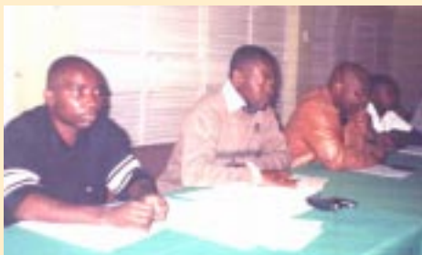
Zambian Farmers at Chipata workshop

group discussions, and plenary sessions. Papers were presented by Farmer Support Organisation (FOSUP), Export Board of