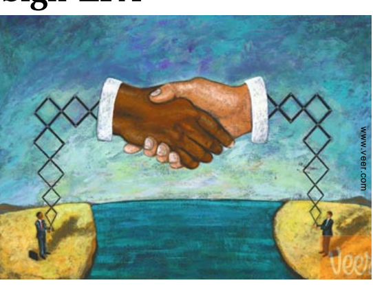
Year 7, No. 4/2008 5

The deal will help Cote d'Ivoire promote its development, improve the competitiveness of its enterprises and enlarge its share in the European market. (allafrica.com 27.11.08)