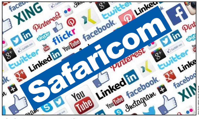
Safaricom is a significant player in the telecom market, whose actions have a deep impact on the consumers

Official reports, such as the Quarterly Sectoral Statistics of October-December 2014, prepared by the CA, indicate that Safaricom has 22.6mn out of the total